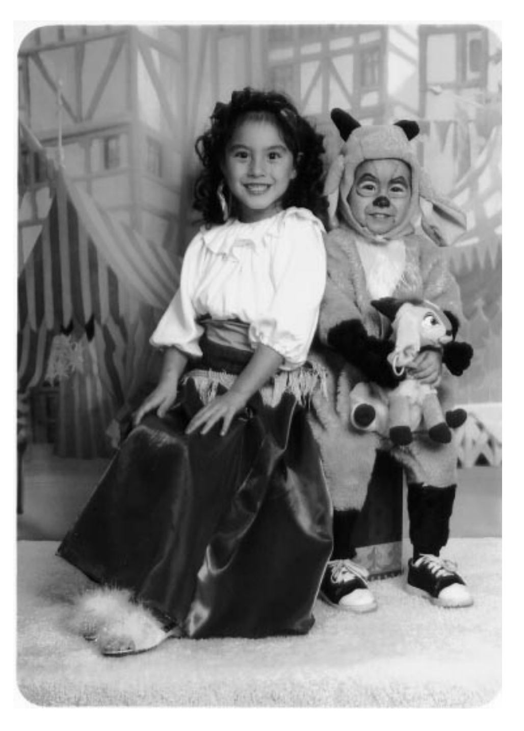
The Beautiful and Exotic Esmeralda and Two Too-Cute Djalis