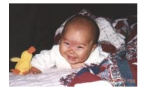
If it's December, I must be crawling!