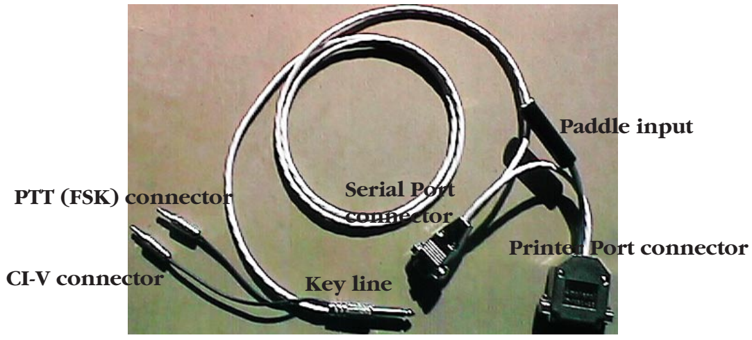
Figure 1. The completed cable assembly.

The cabling between connectors is chosen so that no more than 2 multiconductor cables are fed to either hood. Ideally, the parallel port connector would have three cables fed to it, but its hood would not close with this many conductors—at least with the cable used. A daisy-chain arrangement is employed, with the Key and PTT outputs fed from the parallel port to the serial connector hood, then out again to the rear panel of the IC-706. The Key output (a 1/4" phone plug) receives the cable from the serial hood containing Key, PTT, and CI-V lines. RG-174 coax cable exits from the 1/4" phone plug hood to the PTT and CI-V 1/8" phone plugs. This produced the cleanest overall cabling arrangement.